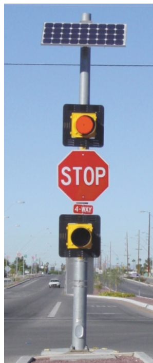
24-hour solar-powered flasher featured on the cover of IMSA Journal, May/June 2004