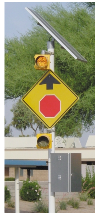
Scottsdale Airpark, AZ