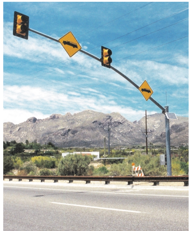
Mast arm installation in advance of fire station with highly-visible warning sign and LED flashers.