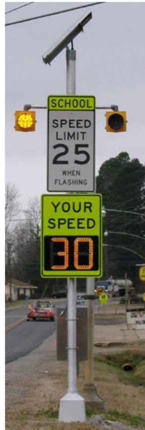
8-inch DC LED lamps