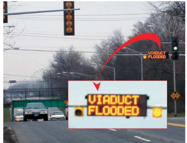
Matteson, Illinois "Viaduct Flooded" advance flashing beacon