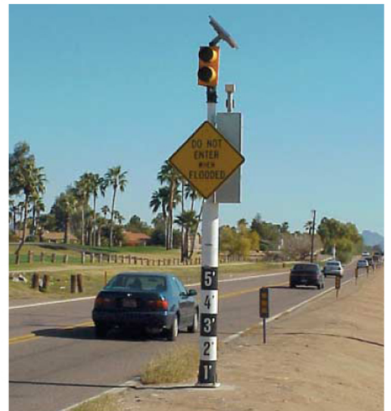
High-water warning system for flash flood area